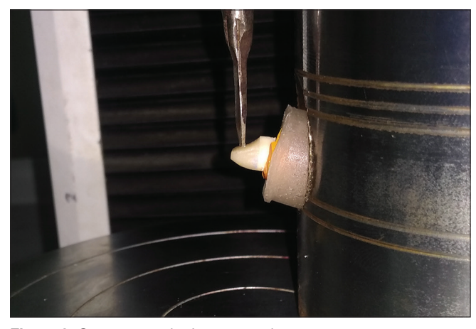
Figure 2: Specimen in the Instron machine

The mean fracture loads after static loading are presented in Table 1. The highest and lowest values of fracture resistance were reported with ZP8 and GFP6 groups, respectively [Figure 3]. One-way ANOVA test within CP, ZP, and GFP groups showed that there was no significant difference in fracture resistance between the posts of length 6 mm and 8 mm in each group. Two-way